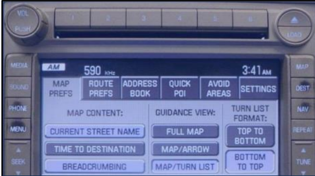
SYNC P Navigation