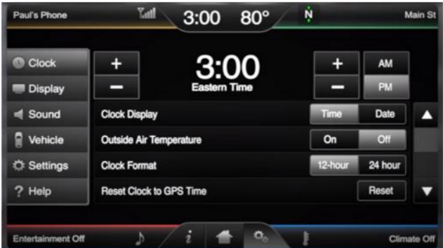
SYNC with MyLincoln Touch

Vehicles Model Year 2016 and older may have one of the following SYNC generations: