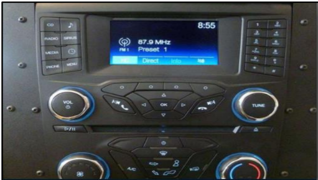
SYNC Gen 1.1