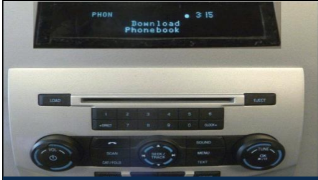
SYNC Gen 1