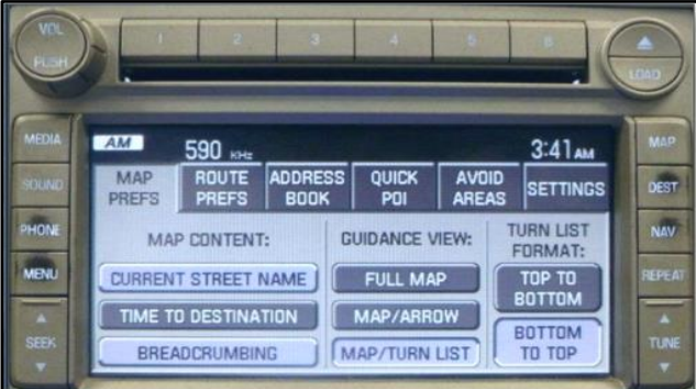
SYNC with Voice - Activated Navigation